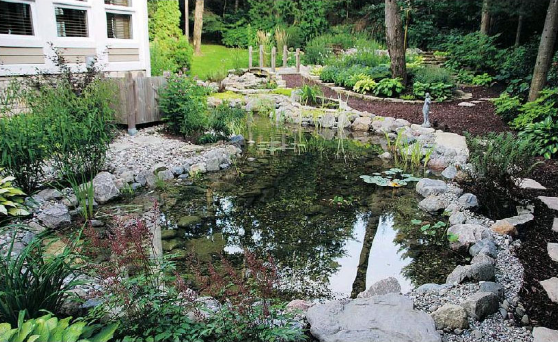
A pond bordered in rocks and greenery serves as a peaceful reflecting pool.